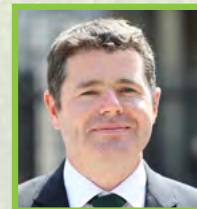
Leo Varadkar, T.D. Minister for Health